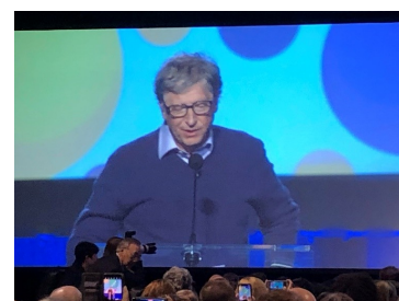
Bill Gates was a keynote speaker at the AAAS Meeting. Mr. Gates' speech centered on the recent investments made by the Bill and