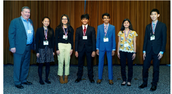
The 2019 Buckeye Science & Engineering Fair Finalists

The 5 th Buckeye Science & Engineering Fair (BSEF) took place on April 6, 2019 with 93 students competing for advancement to the International Science & Engineering Fair (ISEF) in Phoenix, AZ. CAS hosted BSEF, which was sponsored by AEP Foundation and Ethicon. BSEF 2020 is April 4 th .